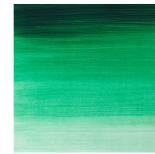
Phthalo Green (Yellow)