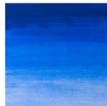
Cobalt Blue Hue