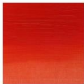
Cadmium Red Hue