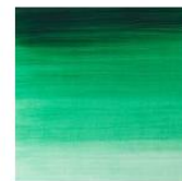
Phthalo Green (Yellow)