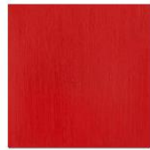
Cadmium Red Medium