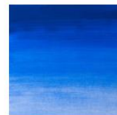
Cobalt Blue Hue