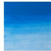
Cerulean Blue Hue