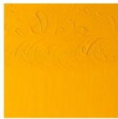
Cadmium Yellow Hue