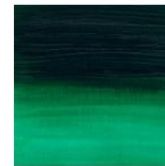
Phthalo Green (Yellow)