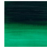
Phthalo Green (Yellow)