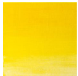
Cadmium Yellow Light