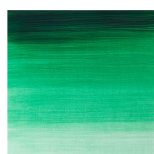
Phthalo Green (Yellow)