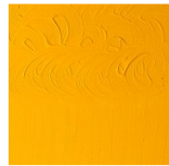
Cadmium Yellow Deep