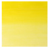
Cadmium Yellow Light