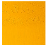
Cadmium Yellow Light