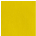
Cadmium Yellow Light