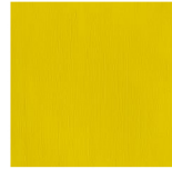
Cadmium Yellow Light