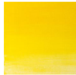
Cadmium Yellow Light